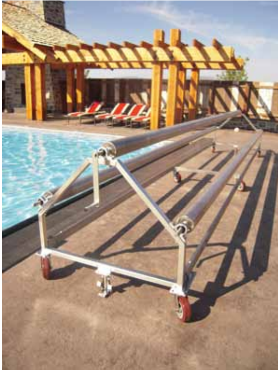
Hands free, easy to use foot brakes. Superb holding power, an industry first.