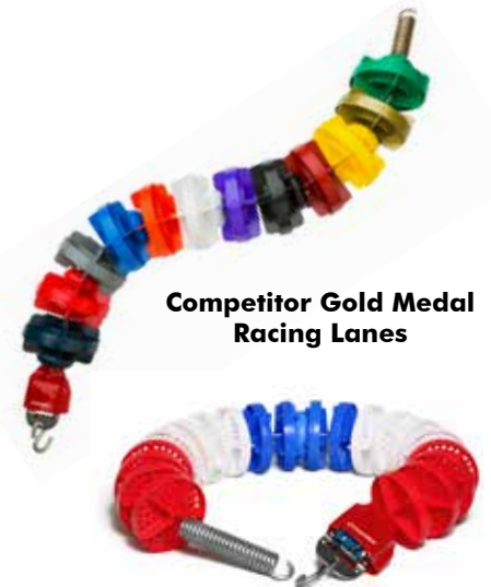
Competitor Gold Medal Racing Lanes