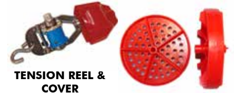
TENSION REEL & COVER