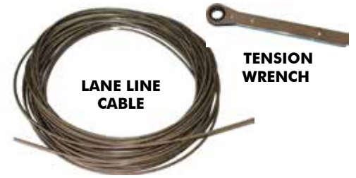
LANE LINE CABLE