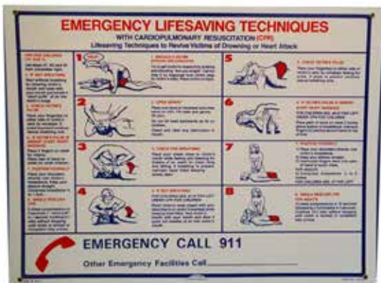
Item No. R231100 Description Emergency Lifesaving (18" x 24") Price $30.00