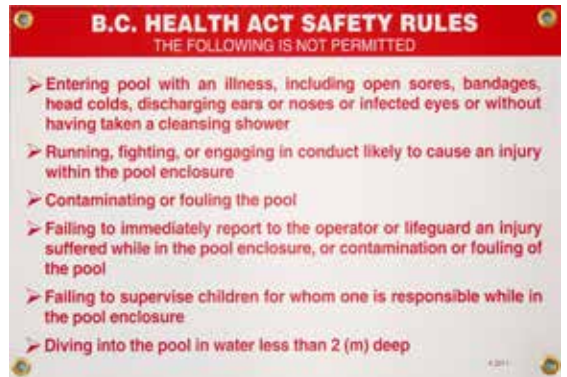
Item No. 18 11 06 Description BC Health Act New Rules (18 1/2" x 12 1/2"H) Price $62.75