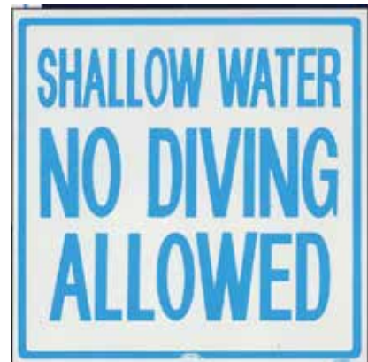
Item No. R233800 Description No Diving Allowed (24" x 24") Price $31.65