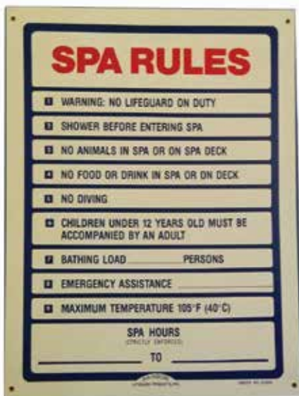
Item No R230300 Description Spa Rules (18" x 24") Price $30.00