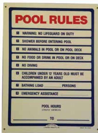
Item No R230400 Description Pool Rules (18" x 24") Price $30.00