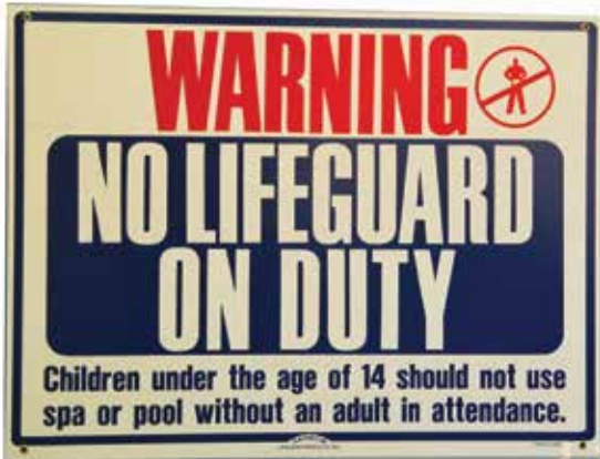
Item No. R230500 Description Warning No Lifeguard on Duty (18" x 24") Price $30.00