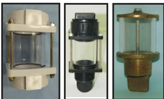
In-line Site Glass