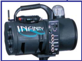
Infinity Start System

An optional tripod is available and must be purchased along with an Infinity. This tripod is heavy duty and designed to be used only with the Infinity.