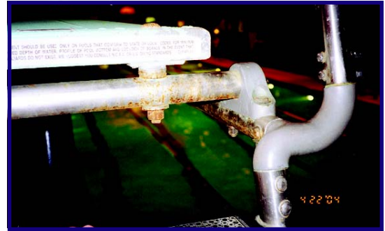
SwimQuip hinged rear board anchor assembly