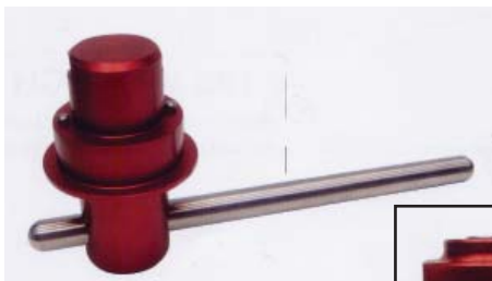
Bulkhead Union Wrench - External

This wrench is designed to fit the bulkhead or thru wall fittings of all Pac Fab filters with 2 inch pipe size fittings. The models are TR100, TR140, TR100C, and TR140C. Note, does not fit 1 1/2" or 3" pipe size fittings. The outside wrench, (with the long bar for a handle) locks onto the outside of the fitting, and the socket fits the large nut inside the filter to complete the tightening process. The socket requires a 1/2" ratchet to drive it which is not supplied. Made of anodized aluminium and stainless steel. Sold separately as the Outside Socket Wrench and the Inside Socket Wrench or as a set.