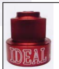
Bulkhead Union Wrench - Internal