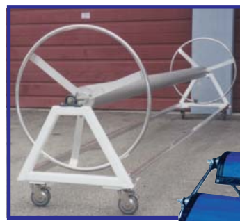
Heavy Duty Aluminium