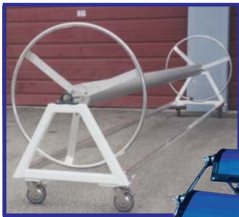
Heavy Duty Aluminium