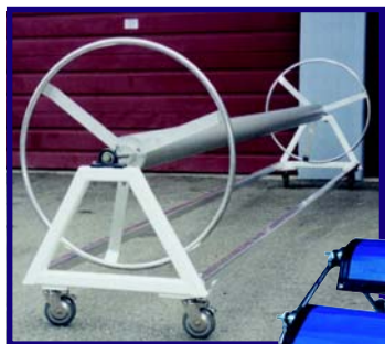
Heavy Duty Aluminium