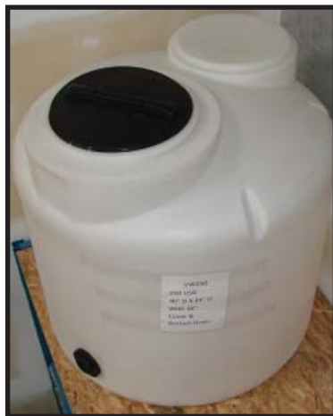
Closed Top Tank