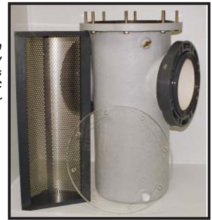
Custom Heavy Duty Fiberglass and PVC strainer

Fabricating a strainer to fit existing piping requires just three measurements plus flange sizes for each side. When you place an order we'll fax a diagram with dimensions to be filled in. If fitting existing plumbing is not a consideration, a standard strainer can be started without any additional information.