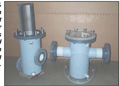
Inlet & outlet can be straight through or offset as required to match existing plumbing.