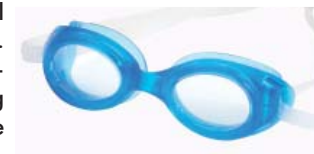
Clear Lens/Blue Frame (CB)