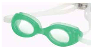
Clear Lens/Green Frame (CG)