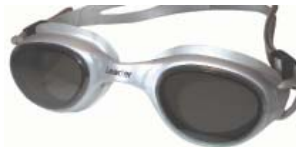
Smoke Lens/Silver Frame (SV)