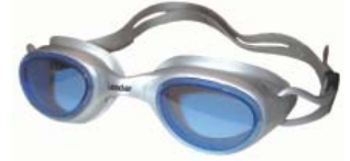
Blue Lens/Silver Frame (BV)