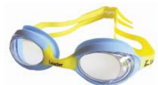
Clear Lens/ Blue & Yellow Frame (CBY)