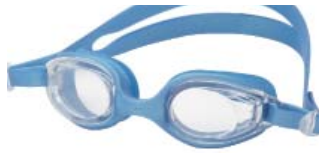
Clear Lens/Blue Frame (CB)