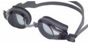
Smoke Lens/Grey Frame (SG)