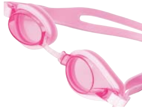
Rose Lens/Pink Frame (660)