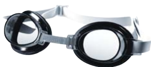
Clear lens/Black Gasket (080)