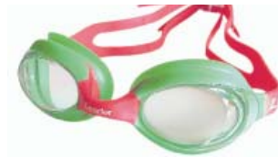
Clear Lens/Green & Red Frame (CGR)