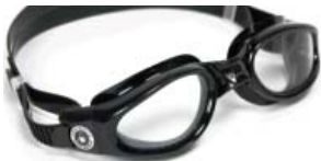
Clear Lens/Asst Frame