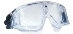
Clear Lens/Clear Gasket

The seal mask is likely the most comfortable swim and sport goggle ever worn! It's large shape is unique in offering great vision as well as eye protection, when using for active watersports in addition to swimming, (wind surfing/kayaking etc.) Curved lens offers nearly 180 degree underwater vision without distortion. This goggle creates an exceptional seal with its 100% silicone dive-mask like skirt.