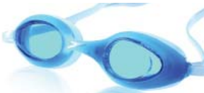
Blue Lens/Blue Frame (004)