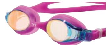
Berry Fizz (479)