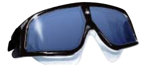
Smoke Lens/Black Gasket