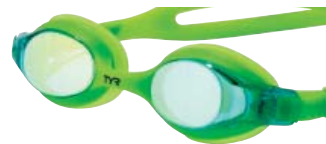
Electric Lime (339)