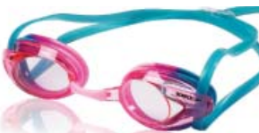
Pale Pink Lens/Pink Multi Frame (066)