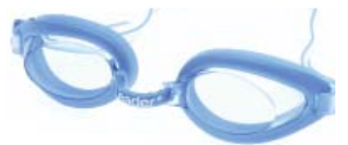
Light blue Lens/Blue Frame (BB)