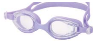
Clear Lens/Purple Frame (CP)