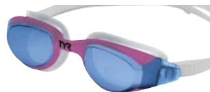
Blue Lens/Pink Frame (670)