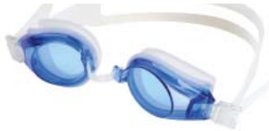
Blue Lens/Clear Frame (BC)