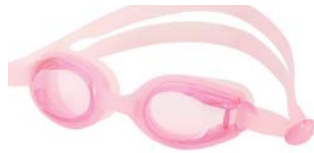
Pink Lens/Pink Frame (PP)