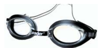
Clear Lens/Charcoal Frame (CH)