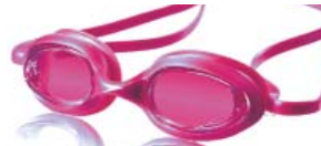
Magenta Lens/Magenta Frame (568)