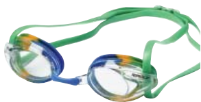
Clear Lens/Blue Multi Frame (004)