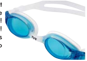
Blue Lens/Clear Frame (420)