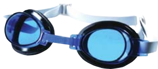
Blue Lens/Black Gasket (004)