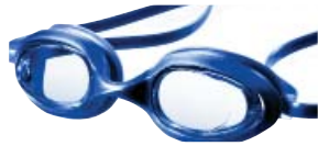
Clear Lens/Navy Blue Frame (041)