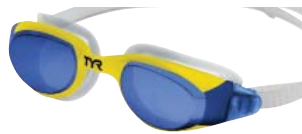
Blue Lens/Yellow Frame (465)