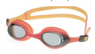
Smoke Lens/Orange Multi Frame (SOX)