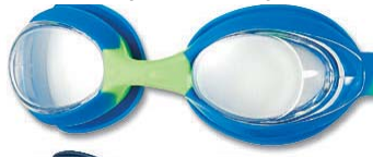
Clear Lens/Blue Multi Frame (101)