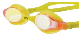
Pink Lemonade (683)