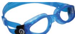
Clear Lens/Asst Frame