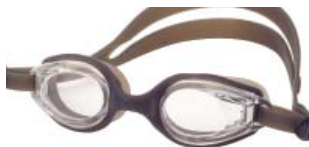
Clear Lens/Smoke Frame (CS)