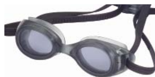
Smoke Lens/Grey Frame (SK)