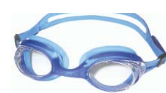
Clear Lens/Blue Multi Frame (CBX)