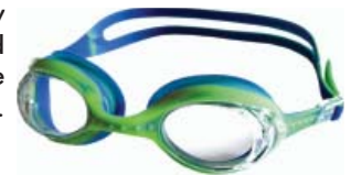
Clear Lens/Green Multi Frame (CGX)