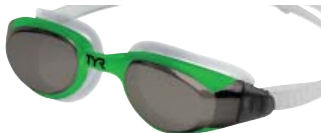
Smoke Lens/Green Frame (085)