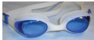
Blue Lens/Clear Frame (420)