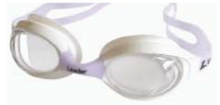
Clear Lens/ White & Purple Frame (CWP)