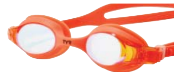
Manic Mango (841)