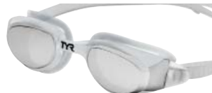
Clear Lens/Clear Frame (101)