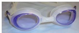
Lavendar Lens/Clear Frame (531)