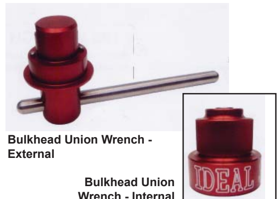
Bulkhead Union Wrench - External